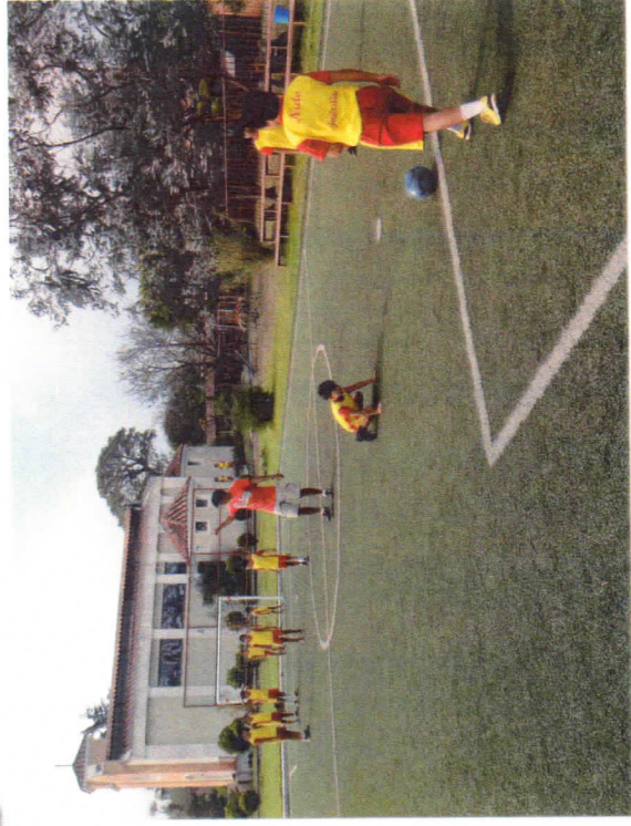
Practice, Practice, Practice