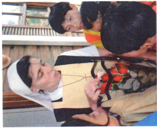
Mother's Day Flowers